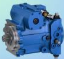
HYDRAULIC PISTON PUMP