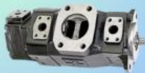
TRIPLE VANE PUMP