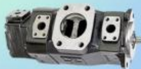
DOUBLE VANE PUMP