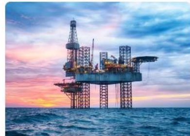
OIL AND GAS APPLICATION