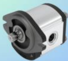
HYDRAULIC GEAR PUMP