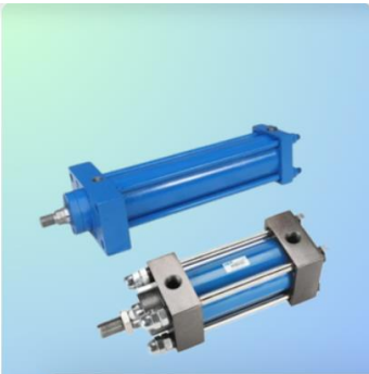
TIE - ROD TYPE