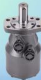
HYDRAULIC GEAR MOTOR