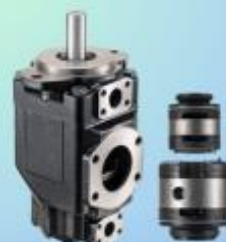
HYDRAULIC VANE PUMP