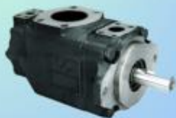
SINGLE VANE PUMP