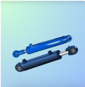
WELDED TYPE CYLINDER