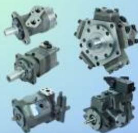
PUMP PISTON MOTOR