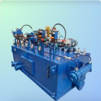
STANDARD HYDRAULIC POWER