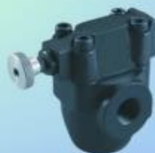
PRESSURE CONTROL VALVE