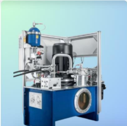
TPM HYDRAULIC POWER