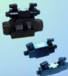
DIRECTIONAL CONTROL VALVE