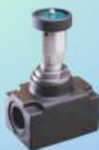
FLOW CONTROL VALVE