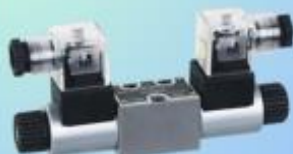
SOLENOID DIRECTIONAL VALVE