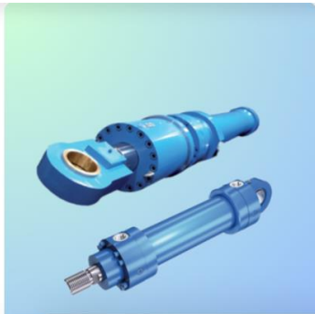
BOLTED / MILL DUTY TYPE